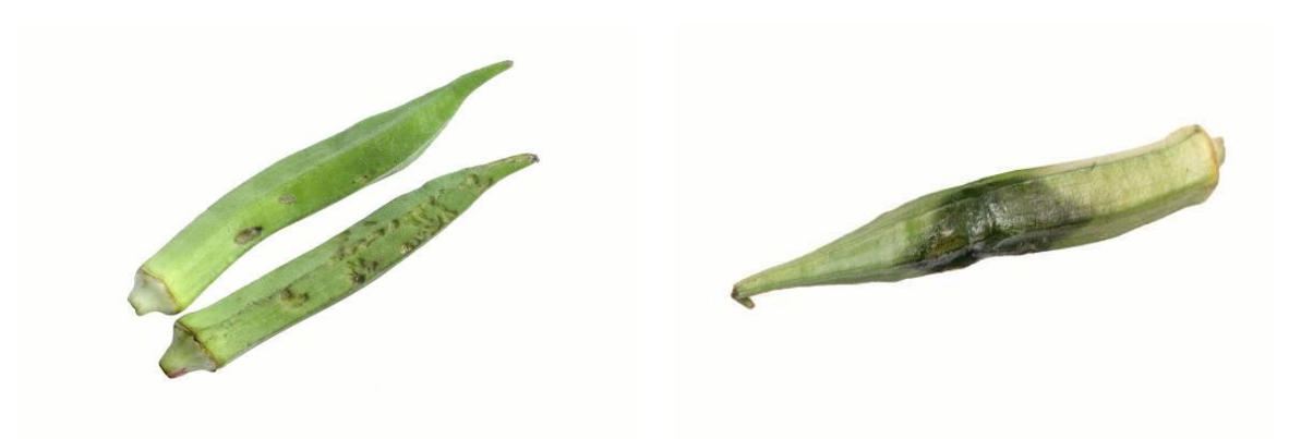
Figure 4. Examples of damages – Pest And Disease