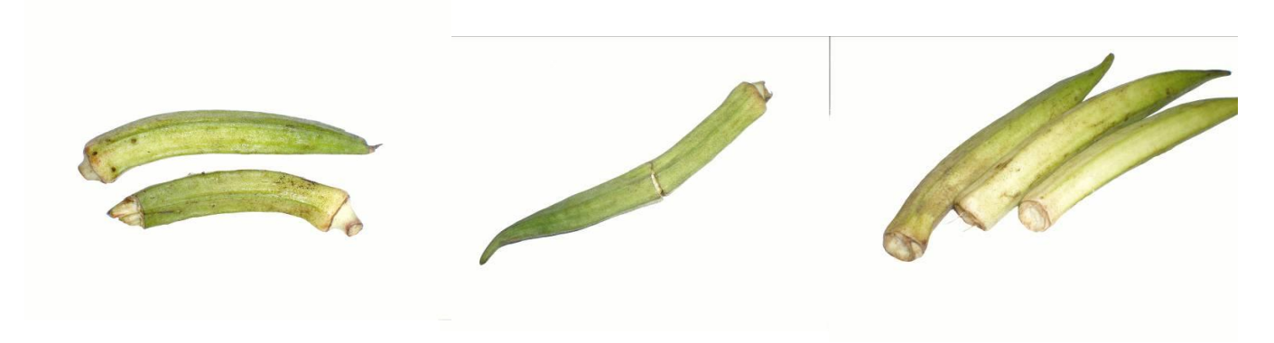
Figure 5. Examples of damages - Mechanical