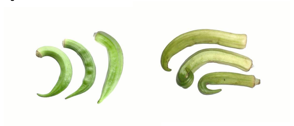
Figure 3. Examples of deforms – Bent and Twisted