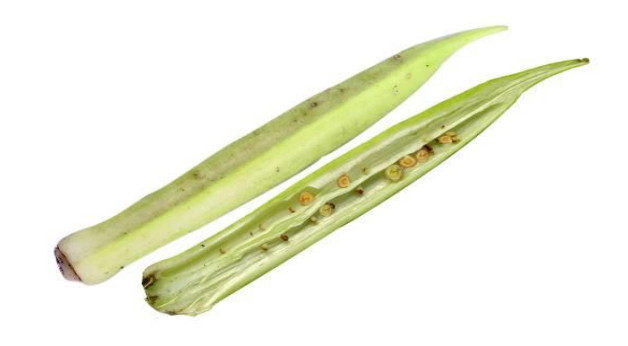
Figure 2. Over-mature